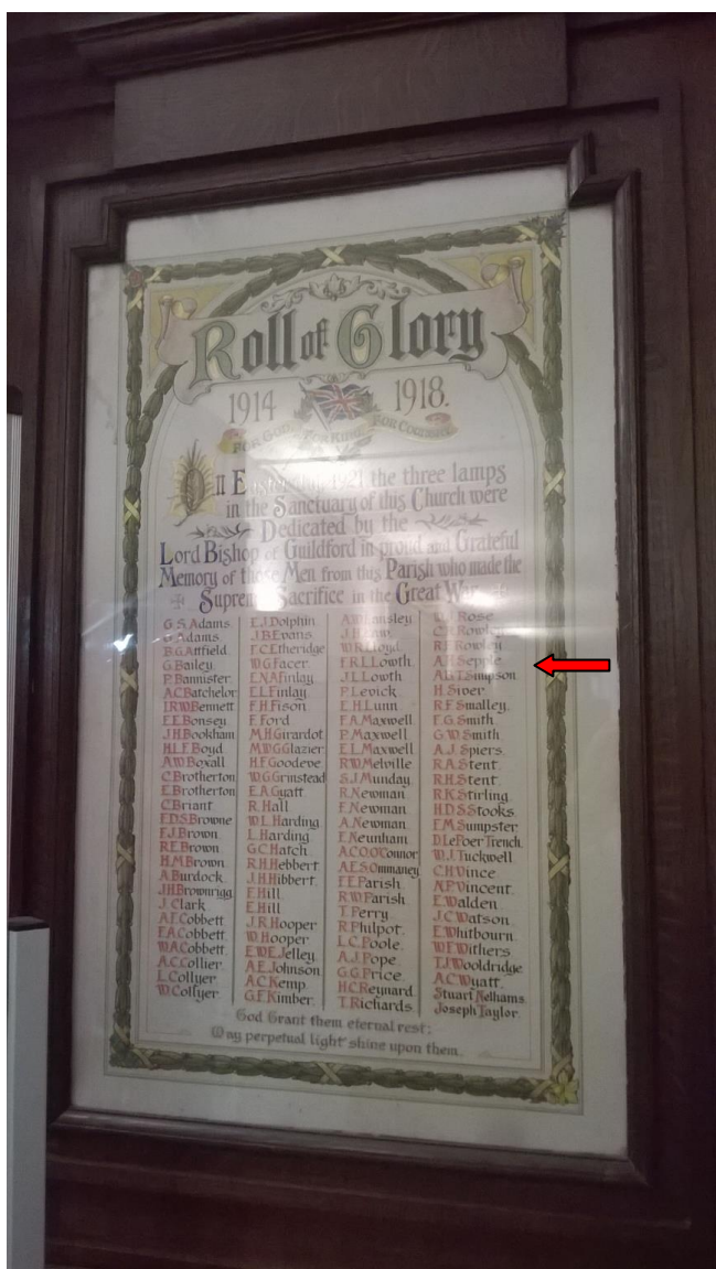
Holy Trinity Church Roll of Glory