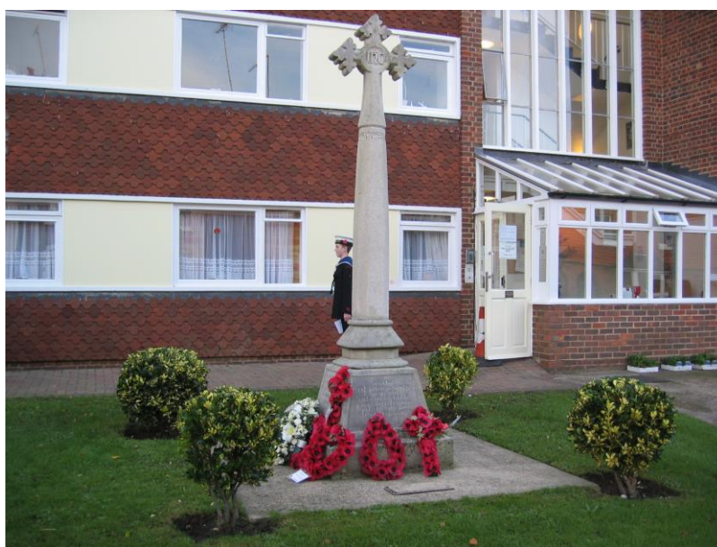
Charlotteville War Memorial