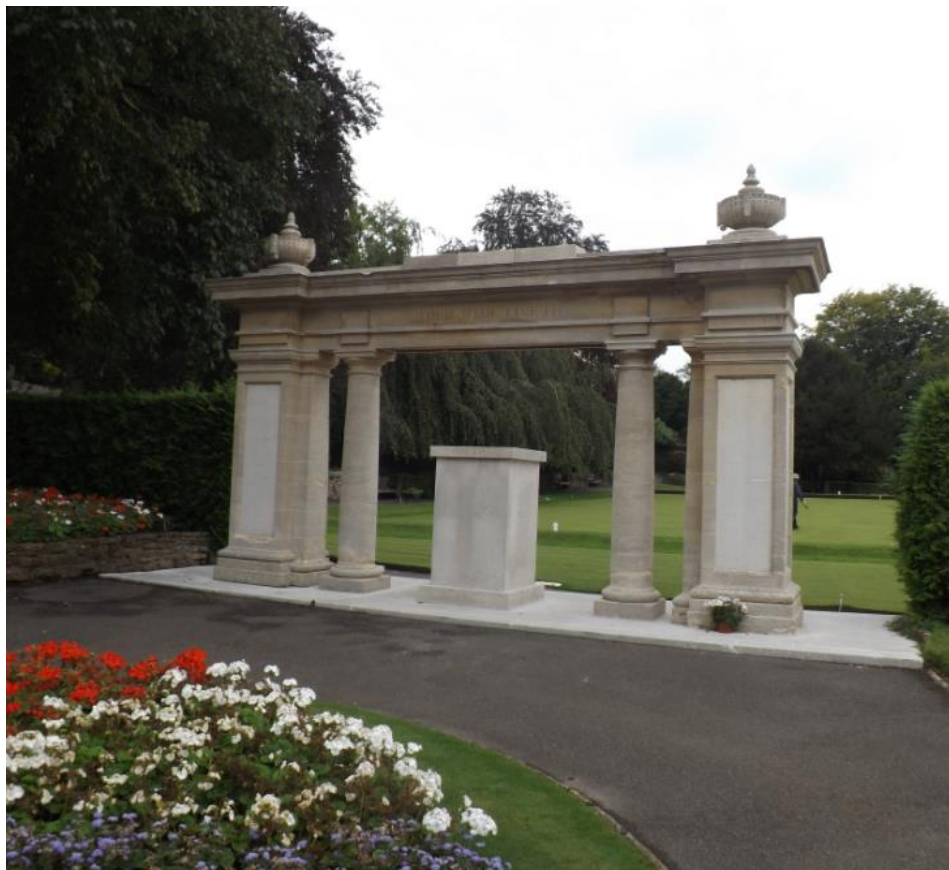
Guildford War Memorial