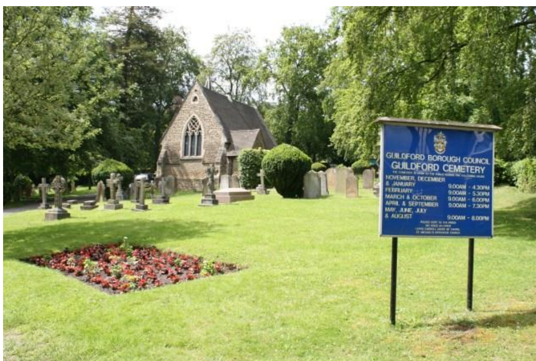
Guildford Cemetery

Guildford Cemetery is on the old Farnham Road. The Guildford War Hospital with 445 beds was established in the Infirmary. There are 33 Commonwealth War Graves in this Cemetery – 13 from World War 1 & 20 from World War 2. There is only 1 Australian War Grave.