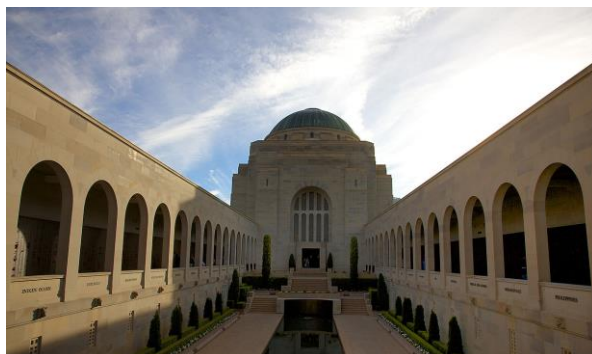
Commemorative Area of the Australian War Memorial